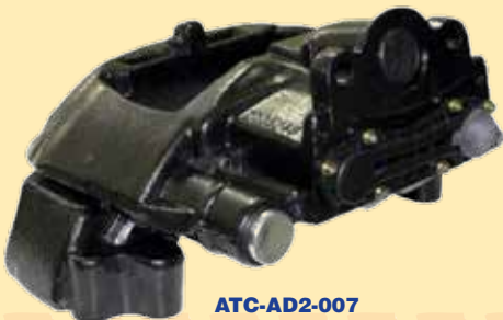
ATC-AD2-007 ATC-AD2-008 (pictured)