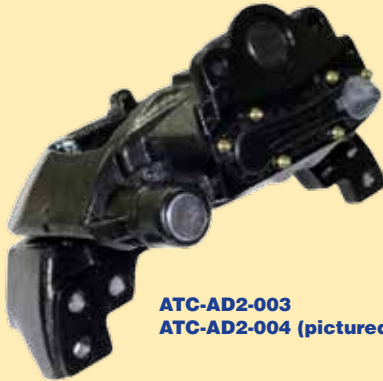
ATC-AD2-003 ATC-AD2-004 (pictured)