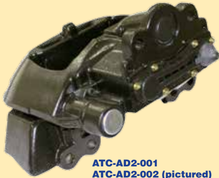
ATC-AD2-001 ATC-AD2-002 (pictured)